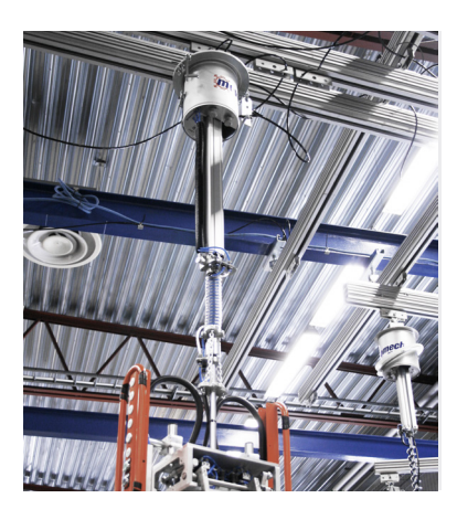
Free rotation offers great advantages in complex assembly operations.

Mechlight Pro 50 is an ergonomic and functional lightweight lifter for loads up to 50 kg.