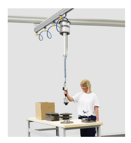
Mechlight Pro facilitates repetitive lifting.